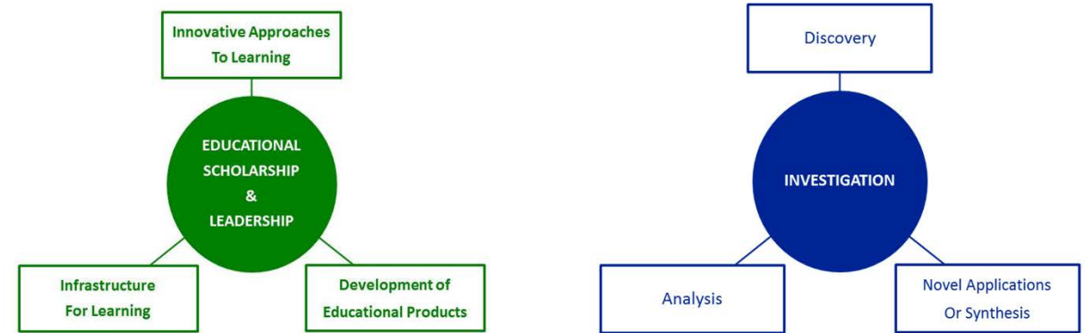
Innovative Approaches To Learning