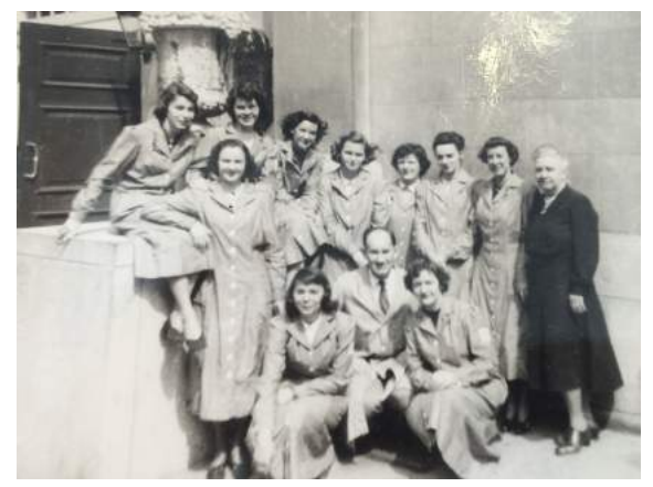
Class of 1986