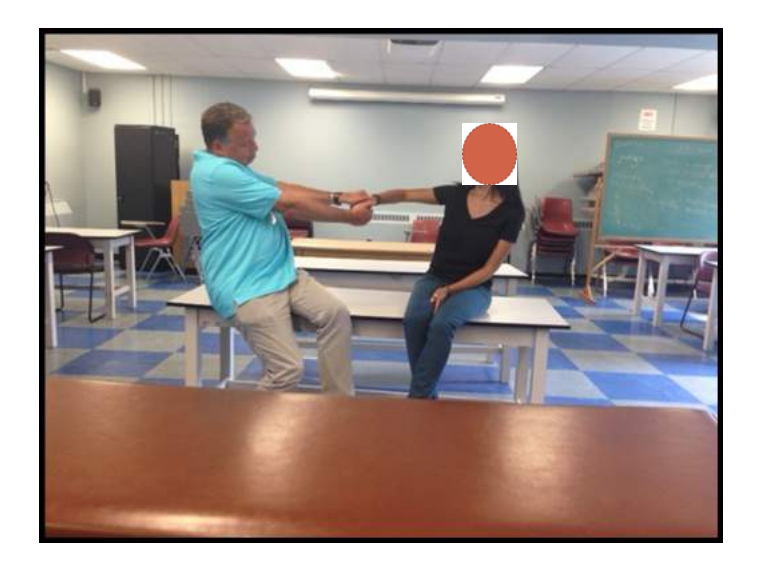
Typical classroom view

This technology has been adopted by the Dental School and is being considered for use in other classes. This research was presented at the 2016 AOTA conference.