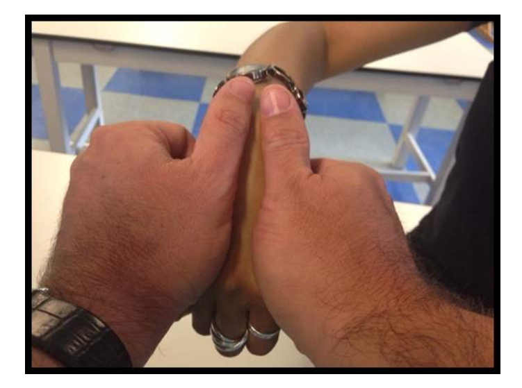
View with Google Glass